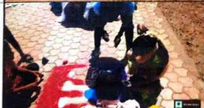
Peth Vadgaon, Maharashtra, India Unnamed Road, Peth Vadgaon, Maharashtra 416122, India Lat 16.816652° Long 74.292571° 24/02/23 12:08 PM