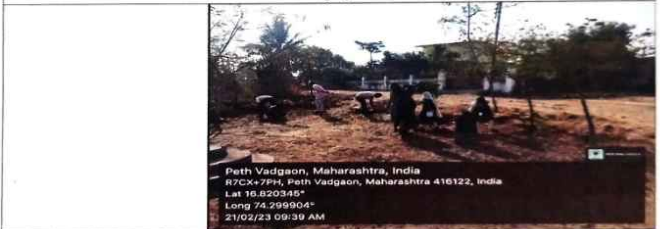
Peth Vadgaon, Maharashtra, India R7CX+7PH, Peth Vadgaon, Maharashtra 416122, India Lat 16.820345° Long 74.299904° 21/02/23 09:39 AM