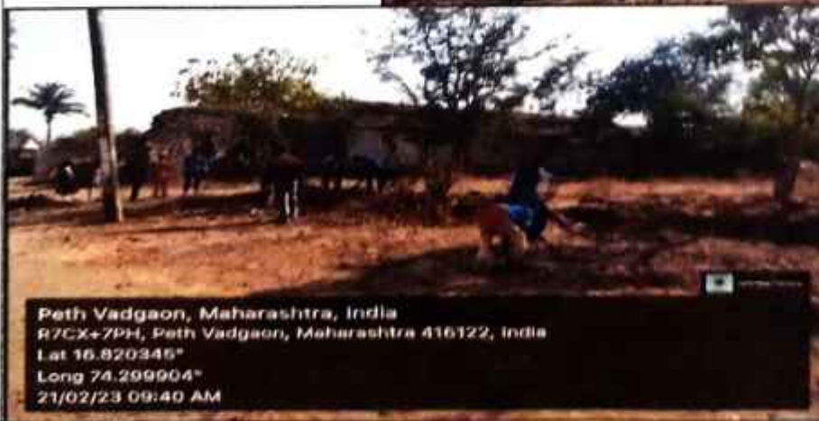
Peth Vadgaon, Maharashtra, India R7CX+7PH, Peth Vadgaon, Maharashtra 416122, India Lat 16.820345° Long 74.299904° 21/02/23 09:40 AM