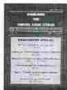
Submitted via CMIS/TA

The Journal is devoted to the study of various issues pertaining to the Himalayan and Trans-Himalayan region. The Journal and Central Asian area themat. associated with its environment, resources, history, art and culture, language and literature, economics, social structure, administration, tourism, regional development, governance, human rights, gender etc.