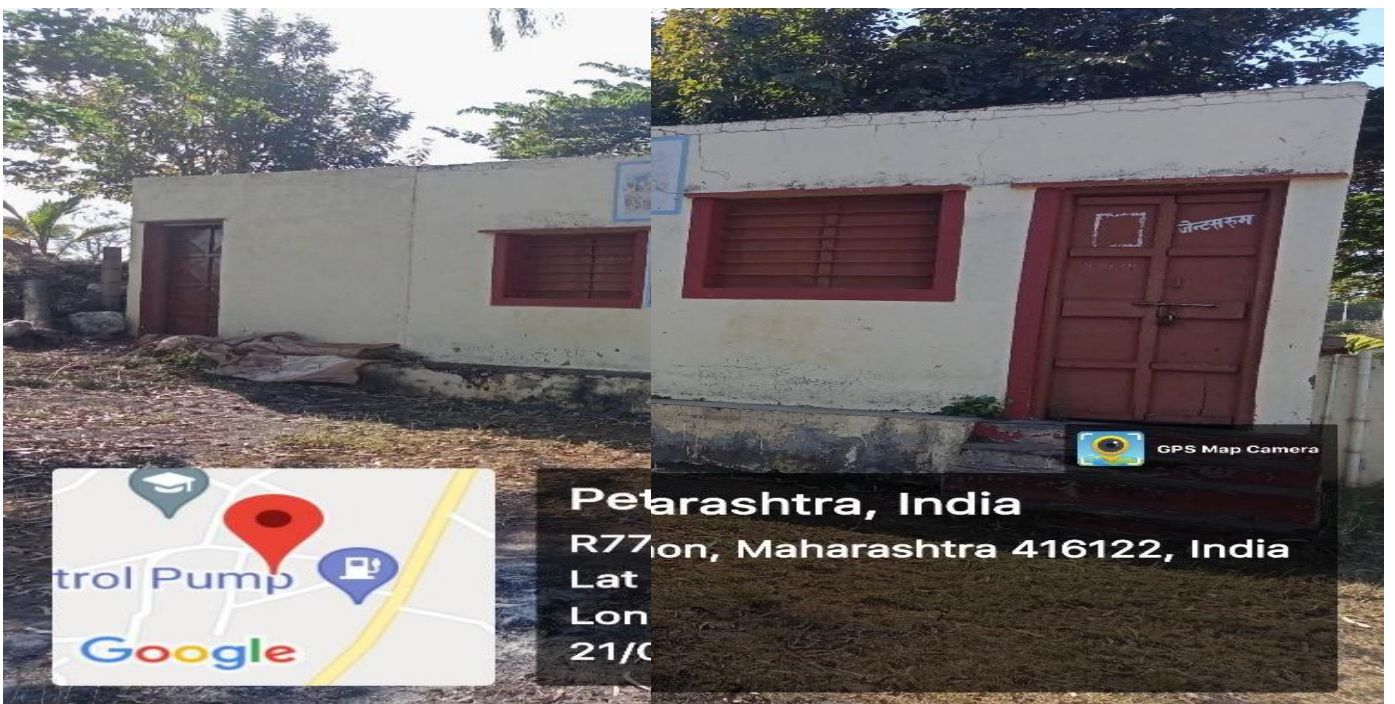
Dressing Room (Boys)