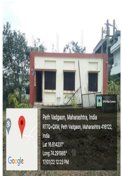
Ladies Common Room