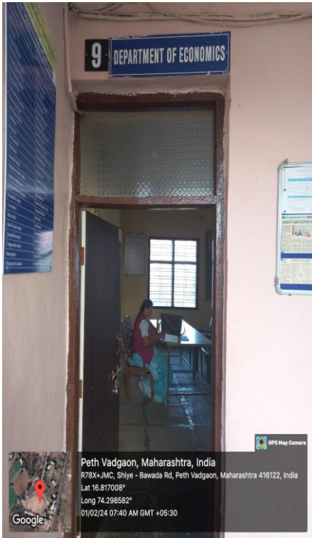
Department of Economics