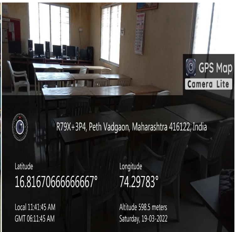
Library Teacher Study Room