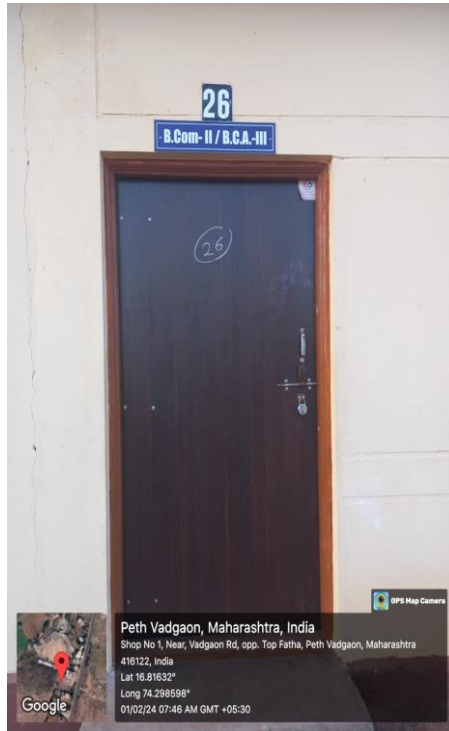
B.Com-II / B.C.A.-III