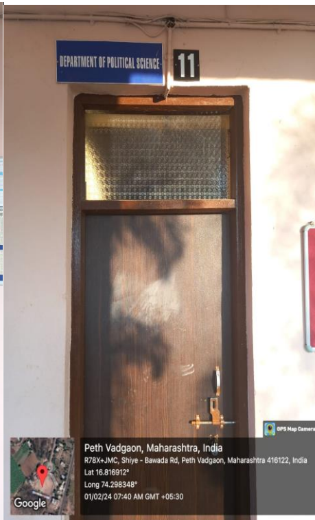
Dept. of Political Science