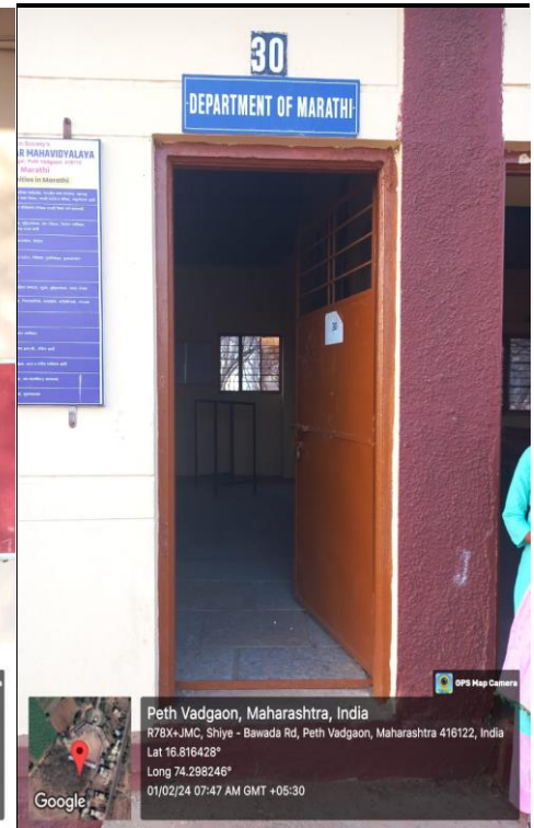
Department of Marathi