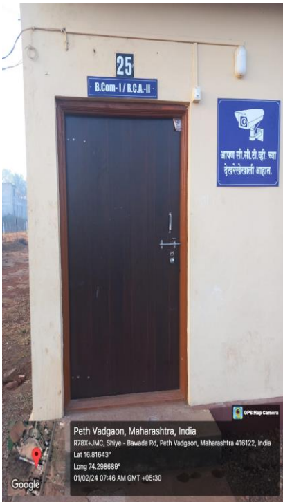
B.Com-I / B.C.A.-II

Barrister Tatyasaheb Mane Vidyanagar, Peth-Vadgaon