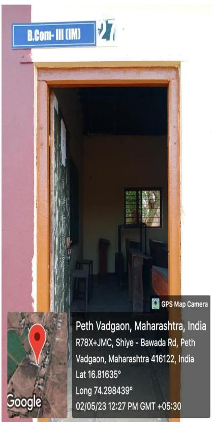
B. Com. – III (IM)