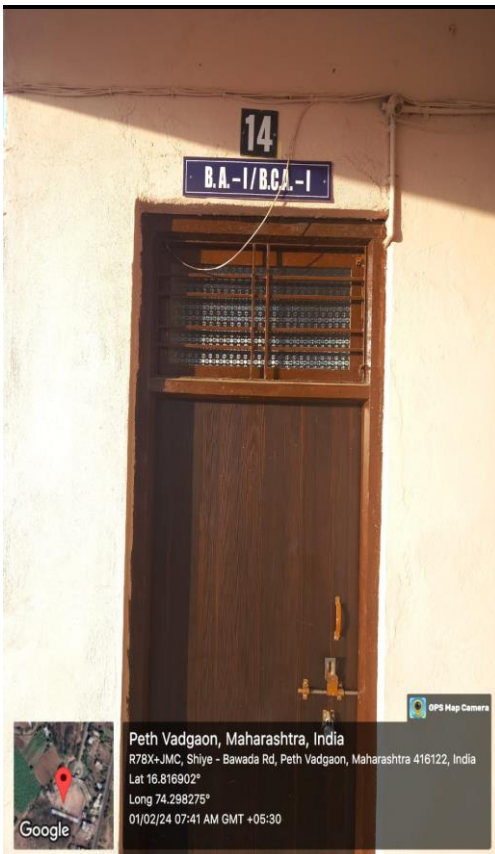
B. A. - I / B. C. A. - I