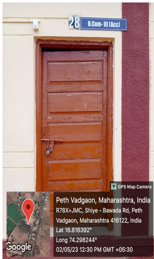
B. Com. – III (A/c)