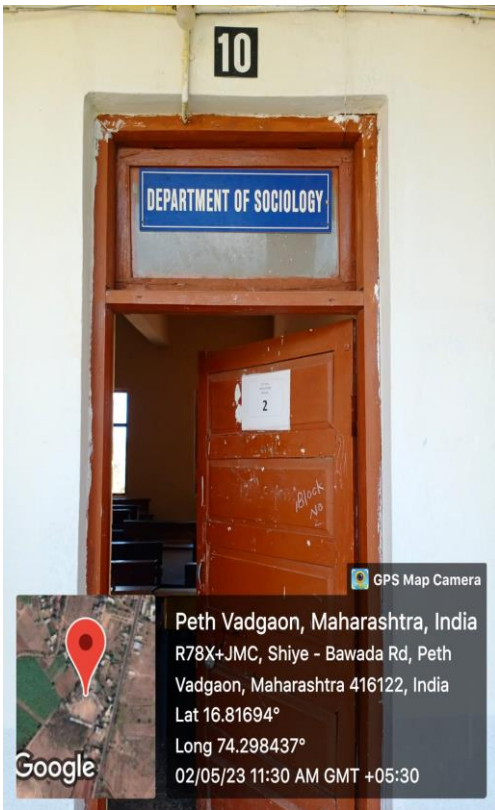
Department of Sociology

Barrister Tatyasaheb Mane Vidyanagar, Peth-Vadgaon