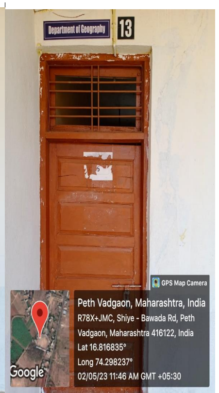
Dept. of Geography