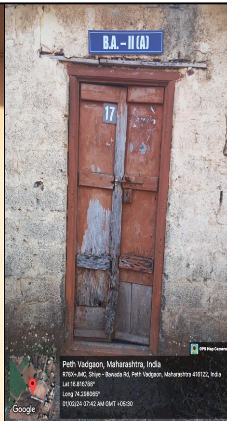
B. A. - II (A)