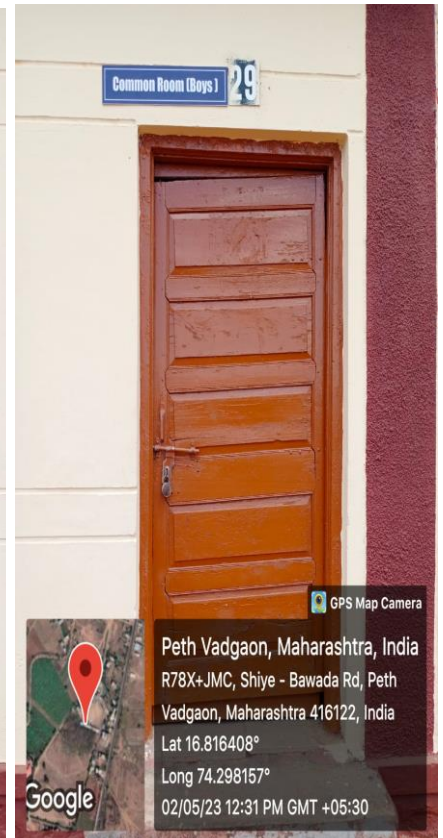
Boys Common Room