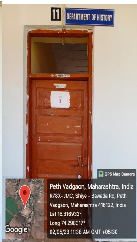
Department of History