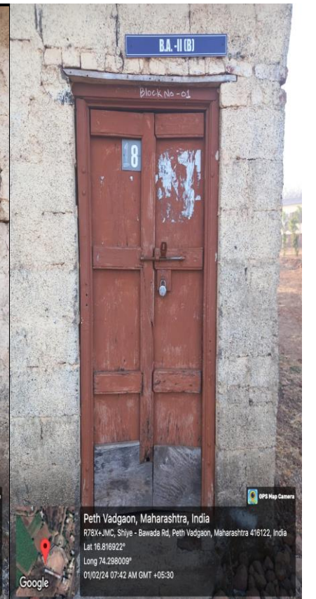
B. A. - II (B)